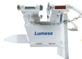
Double base for HBV plate Support for hydraulic crusher

For blocking and breaking up drill rods and chuck tubes. The Lumesa HZ 100 & 180 are characterized by a very light (20 kg – 40 kg) operating weight. Optionally, a breaking device can also be installed. This is especially helpful when using an external casing.